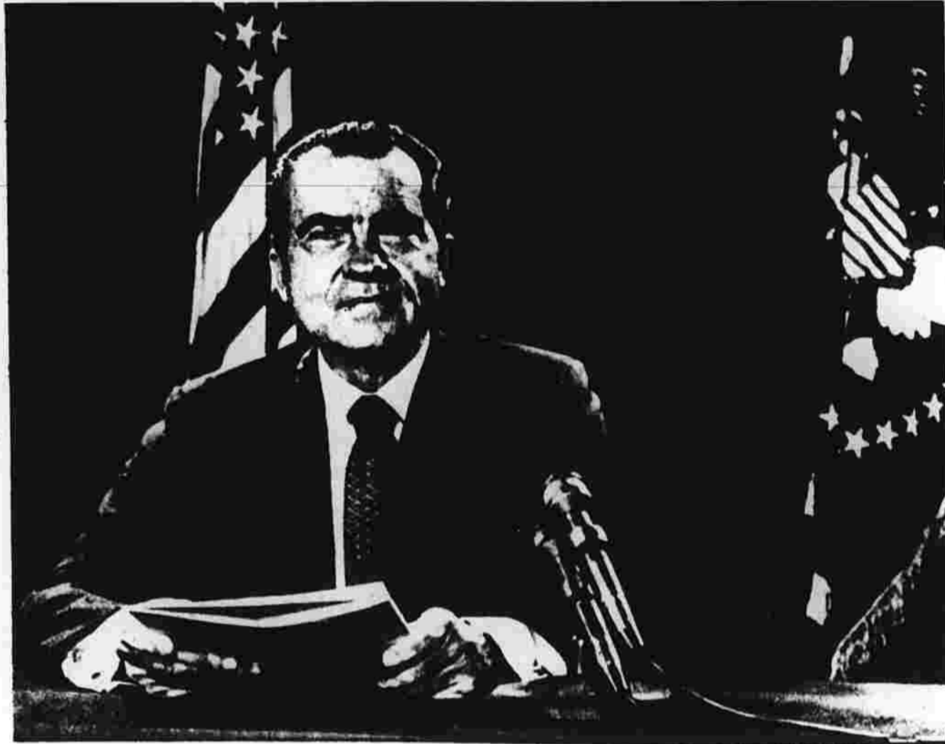
President Nixon poses in White House after delivering report.